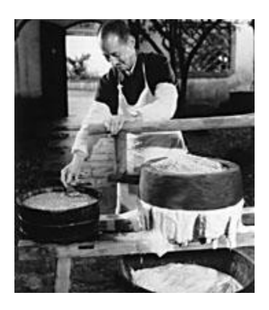
Food for Body and Spirit